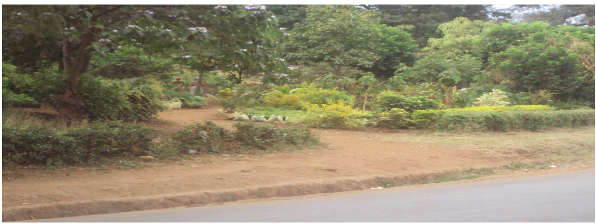
Figure 3.1: Lack of business premises and unplanned township

A nursery garden operating on the road reserve along Rau road in Moshi Municipality due to unplanned township.